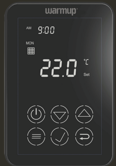
Model W3115DT Black

Designed to make your home smarter and more comfortable.